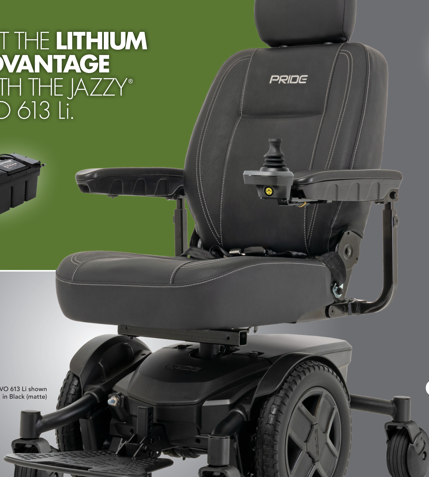
Jazzy® EVO 613 Li shown in Black (matte)