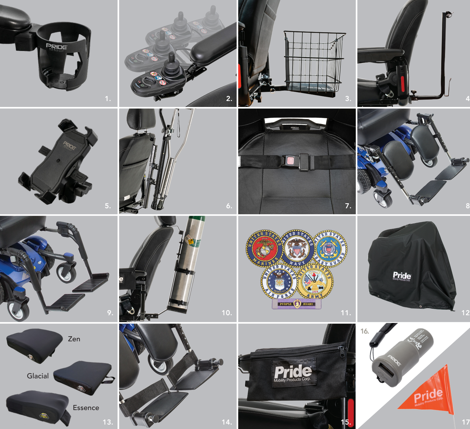
1. New Cup Holder | 2. Swing-Away Joystick | 3. Rear Basket | 4. Walker Holder | 5. New Cell Phone Holder | 6. Cane/Crutch Holder 7. Lap Belt | 8. Elevating Legrests | 9. Swing-Away Legrests | 10. Oxygen Tank Holder | 11. Military Patches | 12. Weather Cover 13. Stealth Products® Cushions | 14. Heel Loops | 15. Saddle Bag | 16. XLR USB Charger | 17. Safety Flag